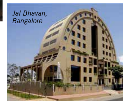
Jal Bhavan, Bangalore

which is rooted in his respect for our planet and its bio-diversity.