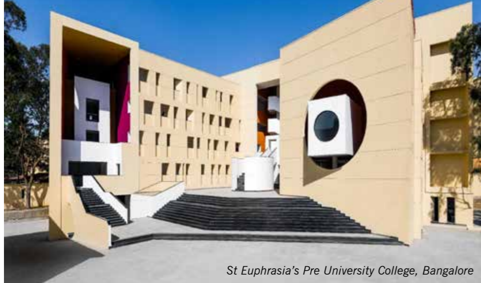
St Euphrasia's Pre University College, Bangalore

The Bangalore-based architect has, in over two decades, left his mark of the unique fusion of engineering and art-centric designs on buildings in India and abroad.